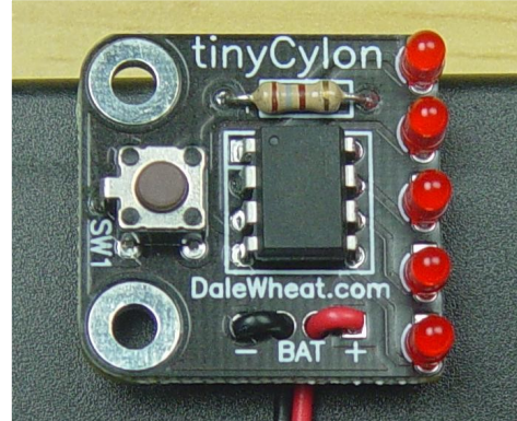
Photo 2. tinyCylon assembled

Let's get started building your very own tinyCylon!