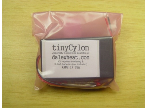
Photo 1. tinyCylon kit